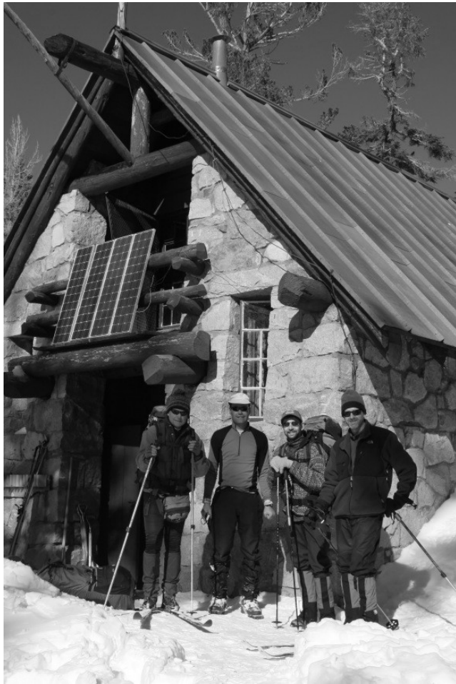
STS'ers preparing to ski out from Ostrander Hut (January 2006)