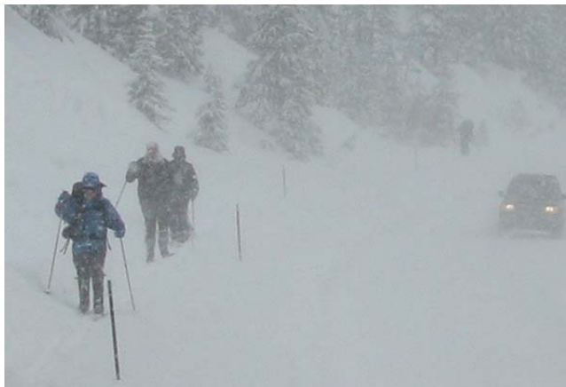
Skiing back to the cars along Hwy 89 (IMG_3505.JPG)

world by the beginning of the President's State of the Union address as I drove the remaining distance to Palo Alto.