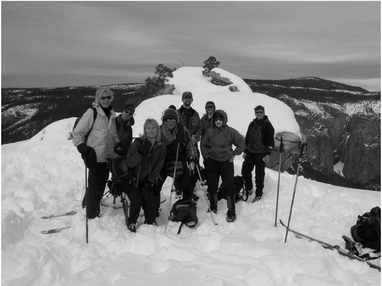
STS'ers enjoying the breathtaking views at Dewey Point (March 2006)